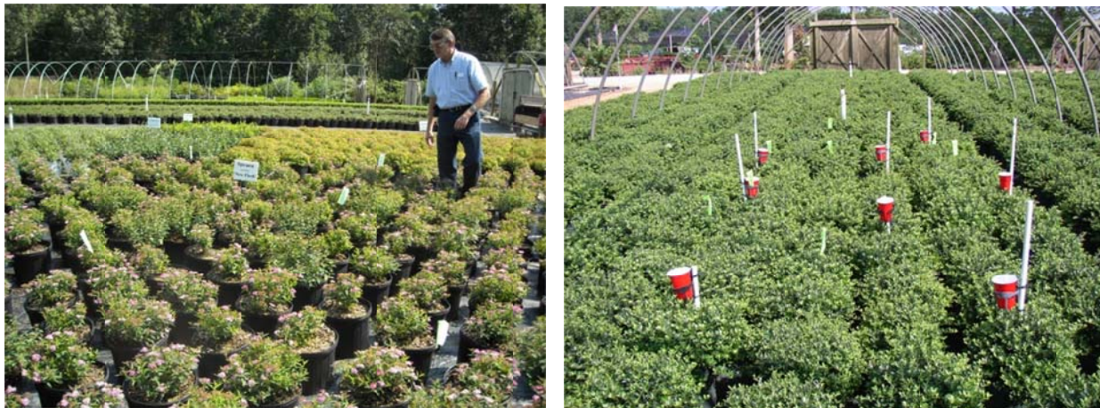
Fig. 1. Spirea plants (left) only partially covering the production area exhibit lower ET values than azalea plants (right) with high percent canopy cover and high ET rates.

Evapotranspiration is water evaporated from leaf (transpiration) and substrate (evaporation) surfaces. The potential rate of ET is affected by weather (primarily solar radiation and temperature) and assumes water is not limiting. The actual rate of ET is affected by plant cover (leaf area), container size and container spacing. Actual ET is less than potential ET when plant cover does not intercept all incoming radiation. A plant's leaf area index (LAI) is a measure of the plant canopy's capacity to intercept incoming solar radiation. LAI is the ratio of leaf area to ground area. As LAI increases, a greater percentage of incoming solar radiation is absorbed resulting in higher plant transpiration but lower substrate evaporation. Once an LAI of 3 (think of 3 layers of leaves over the ground) is reached, essentially all of the incoming solar radiation is captured by typical plant canopies and actual ET approaches potential ET. Because the determination of LAI is a difficult and time-consuming process, C-Irrig uses percent canopy cover to estimate light interception for ET calculations.